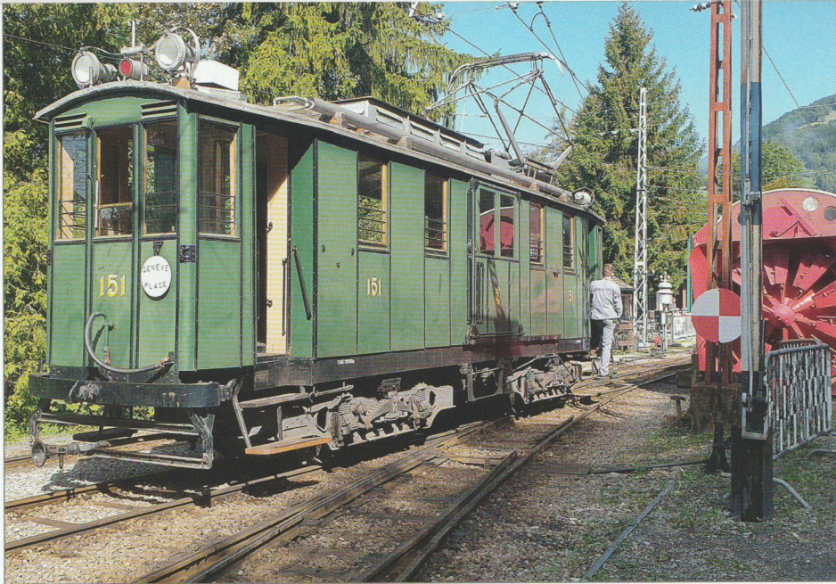
Above: Fe 4/4 No.151 of the Compagnie Genevoise des Tramways Electriques shunts within the museum's grounds at Blonay-Chamby on Sunday 14 September 2025. Bill Salter