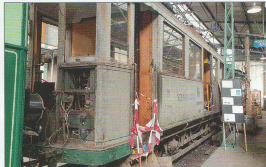
Right: Sernftalbahnen BCFe 2/2 No.4 under restoration at the museum. Bill Salter

inside was moving independently and suddenly understood why staff were making the sign of the cross and wishing us bon courage rather than bon voyage . This railcar is going to need significant work at some stage in the near future. After the customary reversal at Chamby we dropped back down to the museum.