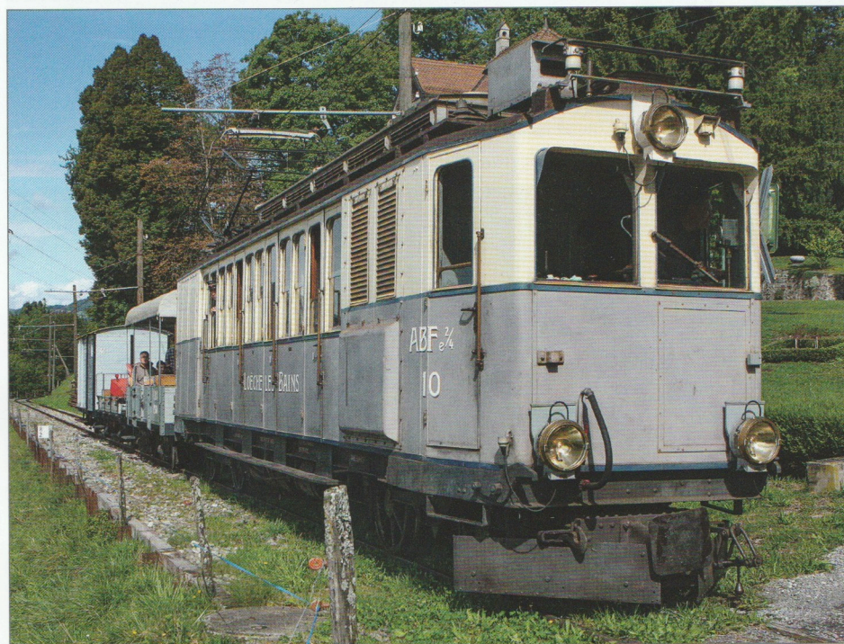
LLB ABFe 2/4 No.10 has run from Blonay and is passing in front of the museum on Sunday 14 September 2025. The train will continue to Chamby and then reverse into the museum. Graeme Henderson

Inside the depot, the museum was keen to show off the progress made with