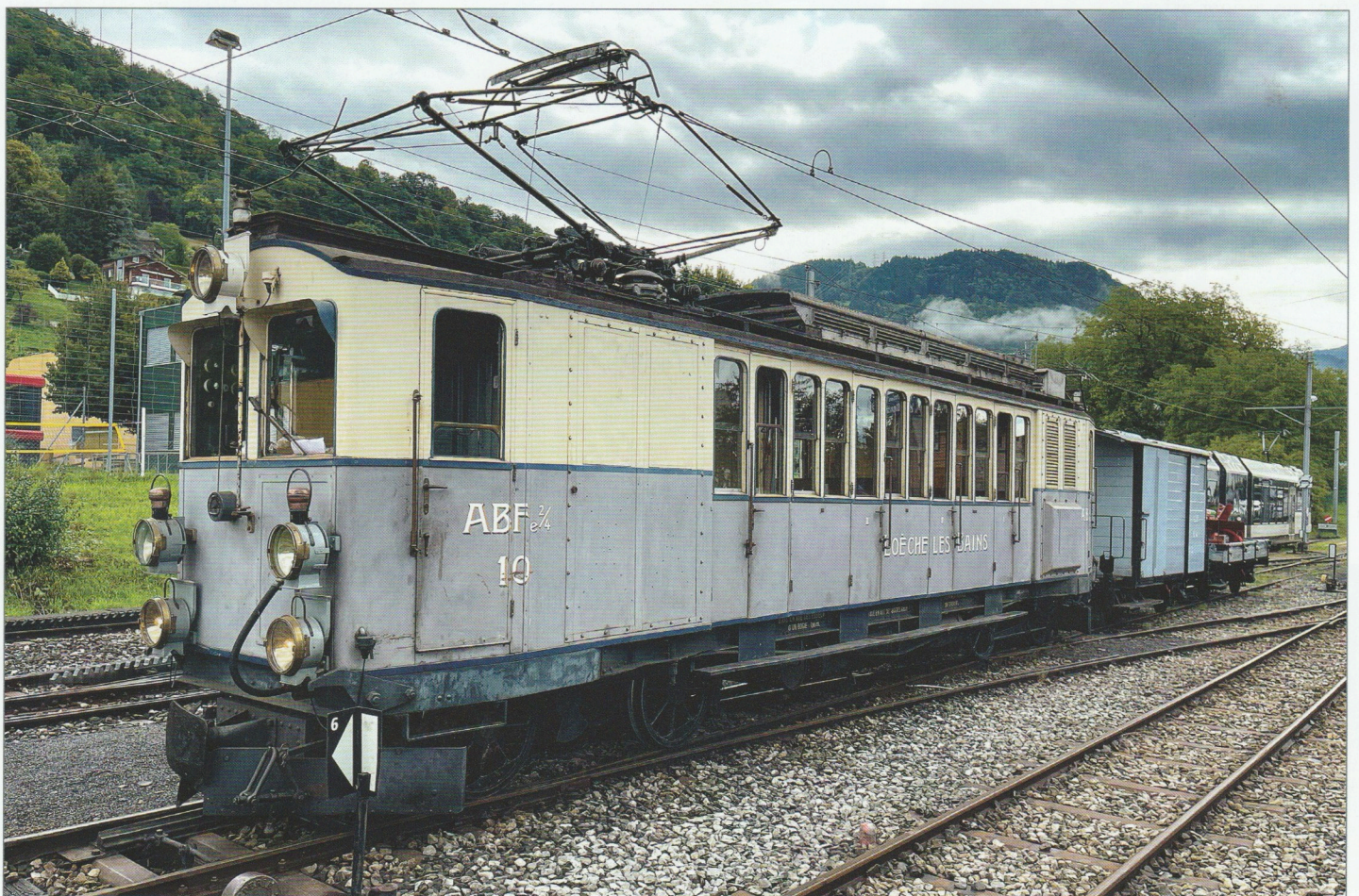
LLB ABFe 2/4 No.10 shunting at Blonay on Sunday 14 September 2025. Graeme Henderson

Soon we set off groaning and creaking up the hillside in our 110-year-old chariot. I immediately noticed that every panel