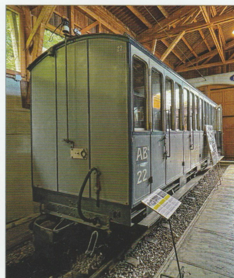
AB4 No. 22. This car is still being restored to traffic.