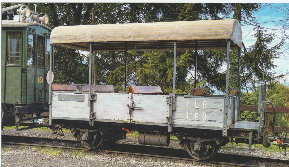
LLB Lo 60.